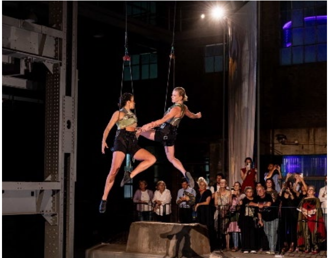
Image: 'Legs on the Wall' White Bay Power Station, 24th Biennale of Sydney Ten Thousand Suns, Katje Ford