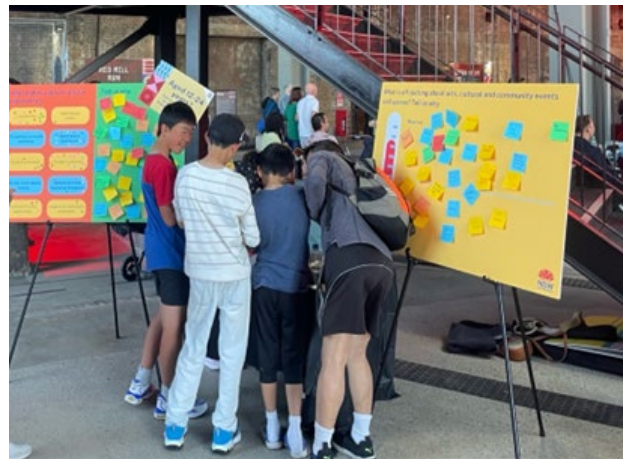
mage: Pop-up session at White Bay Power Station, May 2024

Thank you to everyone who generously provided feedback and ideas throughout the consultation process.